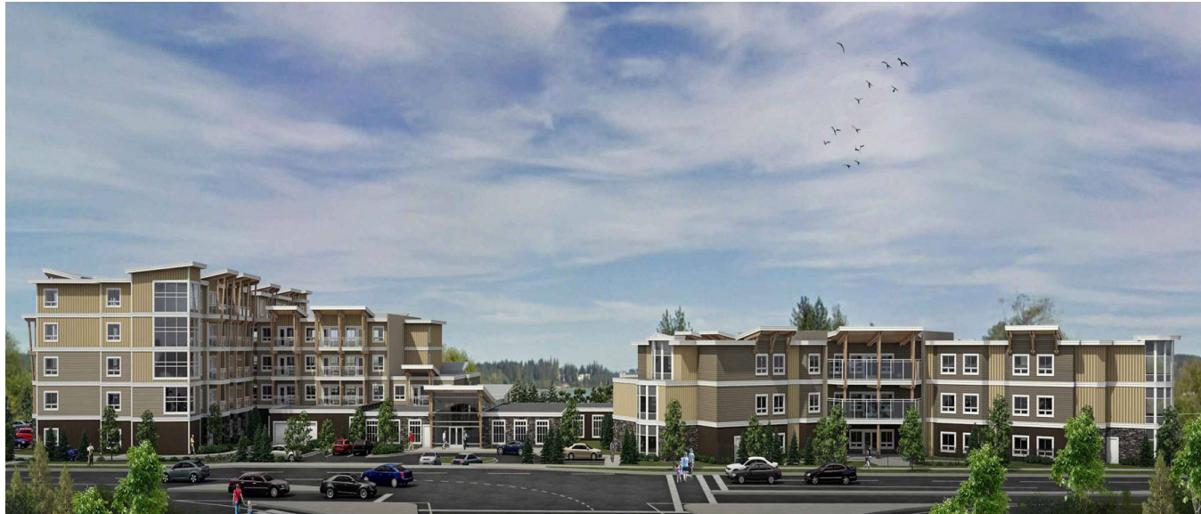
Ocean Front Village Opening Summer 2021